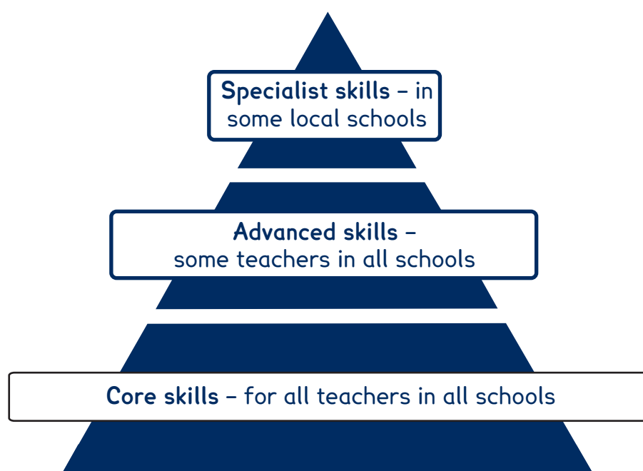
Figure 5: Removing Barriers to Achievement: developing school workforce SEN skills

The first section of this chapter looks at what is already in place to develop these three levels of skill for helping children overcome literacy and dyslexic difficulties. It also proposes what more might be done to better enable schools to advance the progress of children with literacy and dyslexic difficulties.